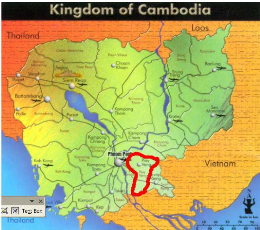
Figure1: Map of Cambodia

The indication shows that more than 50% of woman beggars among the thirty people we have interviewed come from Prey Veng province, and most come from two specific districts: Mesang and Kampong Trabek.